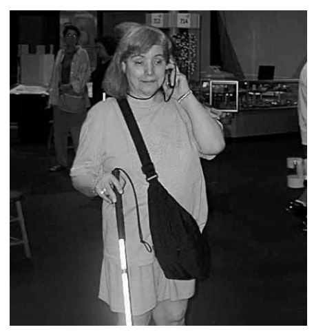
One participant navigating on the exhibit floor.

All participants were able to travel independently, 9 used a long cane and 3 had dog guides. Three participants indicated that they had mild additional impairments: 1 hearing, 1 physical/ motor and 1 print.