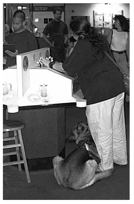
A participant interacting with an exhibit element at Odor Molecules.

Participants' reasons for their preference were